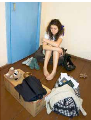
An empty bedroom is not much to smile about.

Recently a single father and his 12-year-old daughter visited us at the Furniture Bank of Central Ohio. The two had been living with friends and family members for months. After moving frequently from place to place, they finally got their own home. Unfortunately, they had nothing to put in it—their new home was an empty shell.