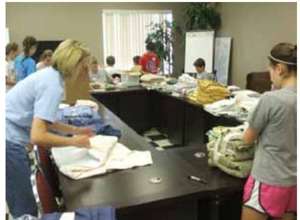
St. Brigid students sort and label housewares donations before stocking the shelves.

One teacher described the experience as "one of the best things I have done as a teacher." The feeling is mutual—it was one of the most fun volunteer groups we have ever had! Thanks to the teachers, parents, and especially the sixth grade students at St. Brigid of Kildare School for helping us turn empty houses into homes!