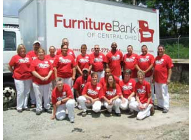
Honda volunteers pause for a picture after a day's work in our shop.

You can see all of the Honda volunteers in action on our website. Visit http://furnbankcoh.wordpress.com/ to view the entire photo gallery.